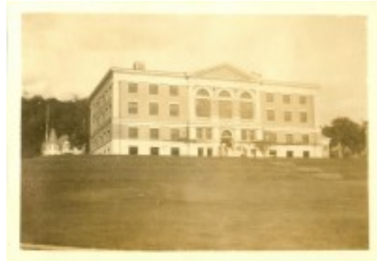
N.A.N.S., c. 1915