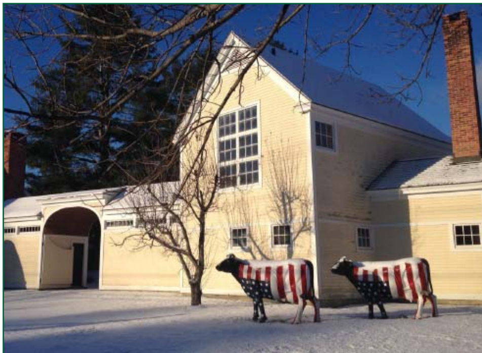
Patriotic cows on Route 43