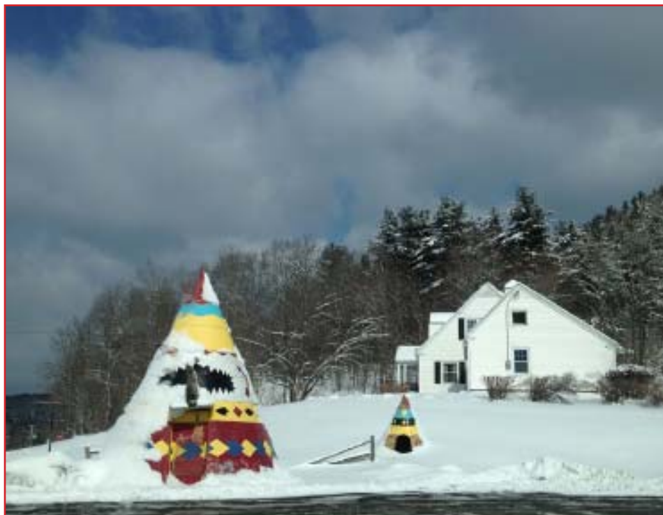
Winter scene on Route 2

All sessions are held on Friday at 3 p.m. in the Faculty Center.