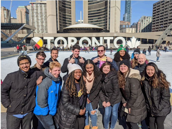
MCLA Model UN delegation in Toronto