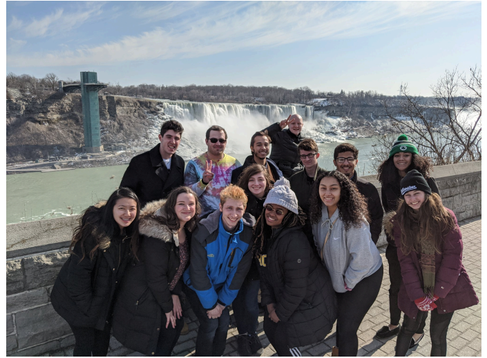
MCLA Model UN delegation at Niagara Falls