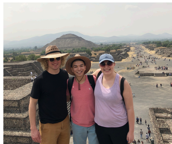
MCLA's 2019 Mexico Travel Course

I appreciate the History and Political Science department for creating a welcoming learning environment and for their encouragement for students to challenge themselves. Even though I embarked on a Mexico-Travel course, delegated at Model United Nations, it is my American Political Institutions (API) course that I recall fondly . Growing up a first-generation Mexican immigrant, I always felt disenfranchised by the same institutions that claimed me. I appreciate API because it educated me on the institutions that exist to serve the people. I did not know it at the time, but API exposed me to the institutions that I would be utilizing in the future to create change. API challenged us with a mock Congress simulation, which required: quick-critical thinking, collaboration, and methodic problem-solving . I encourage all students to consider taking API, because I think there is something of interest there for everyone. It is a course that has a very "familiar-feeling" to it.