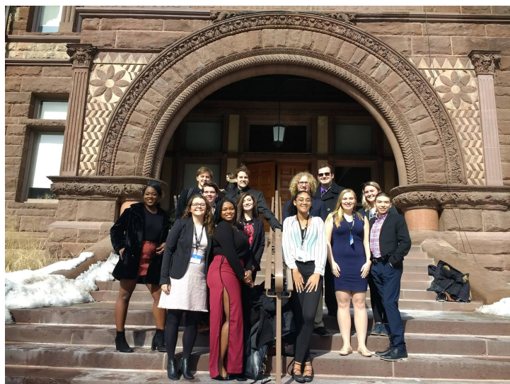
MCLA's 2019 MUN Delegation @ U.Toronto