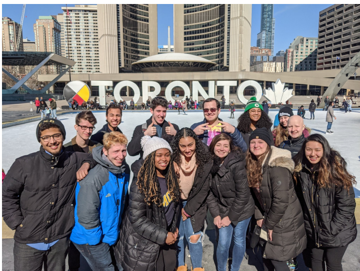
MCLA's 2020 MUN Delegation